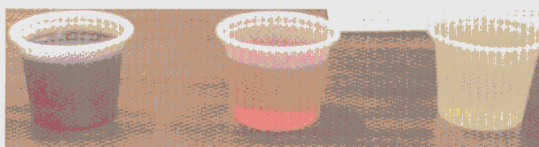
Figure 1. Colored wine samples

Participants in the voluntary wine-judging event were asked to rate the intensity of a variety of wine attributes for three different colored wines. They were told that the impact of presentation order was being investigated. General wisdom says that when tasting a series of wines, it is important to begin with sweeter wines and progress to drier wines. This typically means one first taste pink wines, then white wines, and then finally red wines. If dessert wines are to be tasted, they are tasted last, due to both their high sweetness and high alcohol content. However, this was the cover story. In reality, the wine samples only differed in the amount of food color that was added, and despite color, did not differ at all in sweetness or alcohol