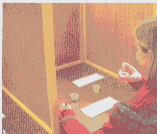
Figure 4. Subject tasting samples