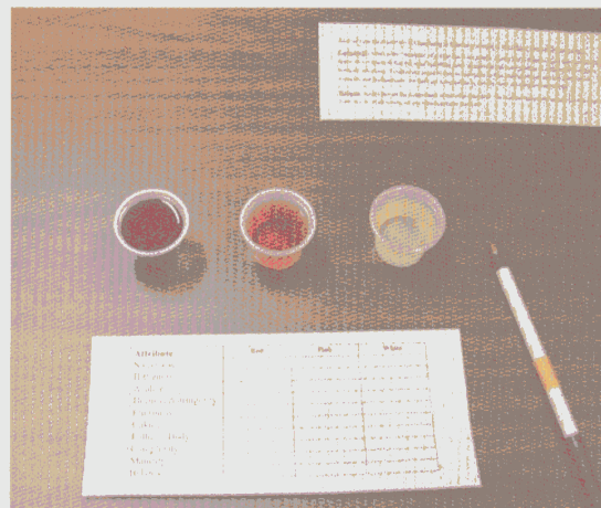
Figure 3. Sample presentation

The first six attributes were chosen because they are typical of the first attributes learned by wine drinkers and